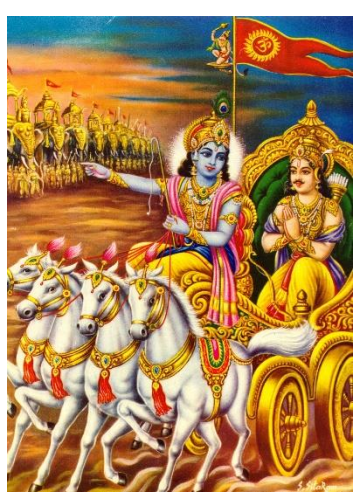
JOBS: SOLDIERS - WARRIORS - POLITICAL LEADERS GOVERNMENT OFFICIALS

Kshatriyas might wear clothing that has to do with their jobs – wartime clothes for militia men and political uniforms for leaders.